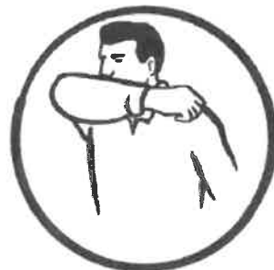
Cover your cough