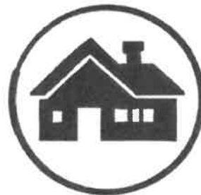
Minimize non-essential travel