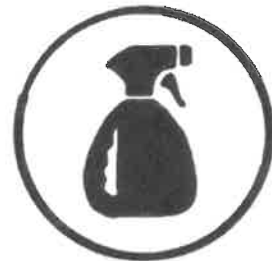
Increase cleaning at home and work