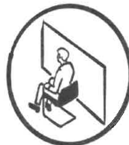
Make spaces safer

THANK YOU FROM THE VILLAGE OF MCBRIDE MAYOR, COUNCIL AND STAFF FOR CONTINUING TO KEEP THE ROBSON VALLEY SAFE FROM THE SPREAD OF COVID-19