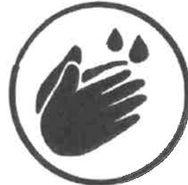
Clean your hands