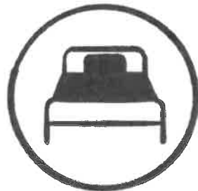
Stay at home If you're feeling ill -no exceptions