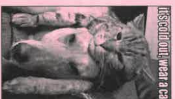
DISCOUNT WEAR A CAT