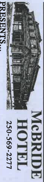
MCBRIDE HOTEL 250-569-2277