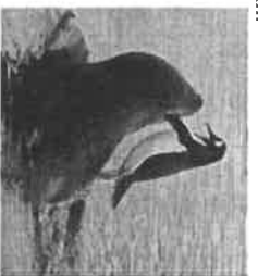
OK, for the last time, WHALES AND SHARKS ARE NOT TO BE PLAYED WITH!