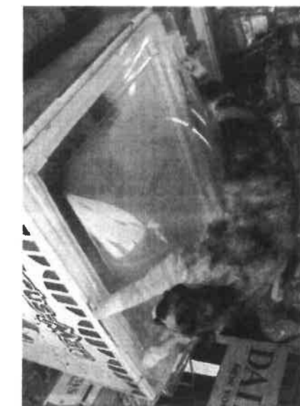
Take a Break in McBride...B.G.'s Friendliest Town!!