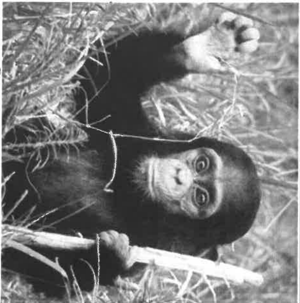
Be vewwy vewwy quiet, I'm hunting wabbit.

email:mmramosch@hotmail.com, or call (250)694-3719