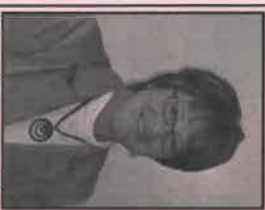
Sales Representative McBride, BC