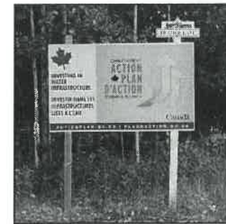
Grants at work!

Our Waste Water project has been funded by: