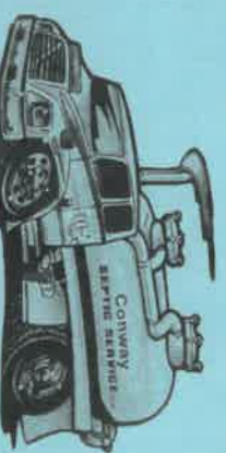
Call us at: 250-569-8880 or 250-569-7371

We're here to help you maintain and manage your septic system.