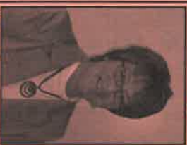
Sales Representative McBride, BC