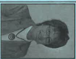
Sales Representative McBride, BC

Toll Free: 1-888-563-7397 Email: ireneb@royalpage.ca www.mountainviewrealtv.ca