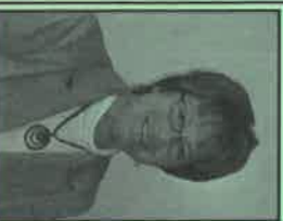
Sales Representative McBride, BC

*2002 Ford Focus stationwagon, auto, air, four winter tires, 192000km, $4900.00, #6131 *2006 Ford F250 XL/T, extracab, 4x4, diesel, shortbox, auto, FACTORY WARRANTY, 135000km, $18000.00, #6577 *2005 Chev Cobalt, 2 door, black, 5 speed, air, cruise, power locks and windows, 70400km, CASH PRICE $6000.00, #9498 *2006 Chev Cobalt, supercharged, 2 door, black, 5 speed, loaded, 45000km, CASH PRICE $10,000.00, #7732 Phone Dave or Wade at 250 569 8830 for further information. DL11107