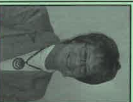
Sales Representative McBride, BC

For Sale 2006 Ford F350 XL1T, crewcab, 4x4, diesel, shortbox, auto, 104000km, $18000.00, #0922 2007 Ford F150 XL1T, extracab, 4x4, shortbox, auto, 35000km, $16,995.00, #4270 2008 Ford F350, Lariat, 4x4, Diesel, crewcab, longbox, auto, 30000km, $27000.00, #1673 2008 Ford F350, Lariat, 4x4, Diesel, crewcab, dually, longbox, auto, 90000km, $27000.00, #1668 Phone Dave or Wade at 250 569 8830 for further information. DL111107