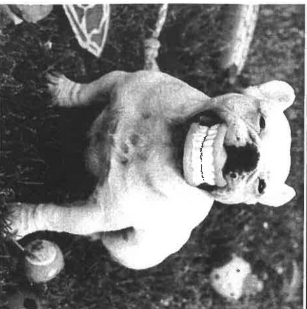
I'm having a difficult time adjusting to my new dentures.