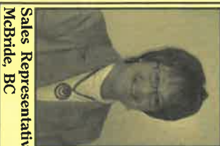
Sales Representative McBride, BC

Toll Free: 1-888-563-7397 Email: ireneb@royalpage.ca www.mountainviewrealty.ca