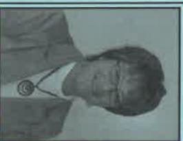
Sales Representative McBride, BC

Toll Free: 1-888-563-7397 Email: ireneb@royallepage.ca www.mountainviewrealty.ca