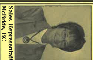
Sales Representative McBride, BC

Toll Free: 1-888-563-7397 Email: ireneb@royalpage.ca www.mountainviewreality.ca