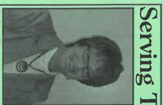
Sales Representative McBride, BC

** LOGGERS BONSPIEL ** March 27, 28, 29 Dinner, Dance with the Roadside Splinters Come curl with us and get rocking around the clock! Call 250-569-3366 to register a team or to sponsor a team