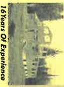
16 Years Of Experience

Box 982 McBride, B.C. V0J 2E0 Phone: (250)569-2269 Cell: (250)569-7147 E-mail: gamoore@telus.net