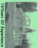
16 Years Of Experience

Box 982 McBride, B.C. V0J 2E0 Phone: (250)569-2269 Call: (250)569-7147 E-mail: gemoore@telus.net