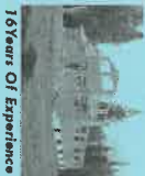
16 Years Of Experience