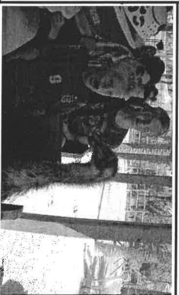
Excuse me but is this seat taken?