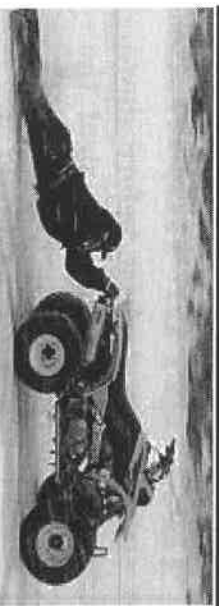
I knew I should have paid the extra money for the auto shutoff!