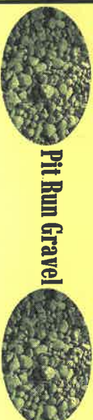
Pit Run Gravel