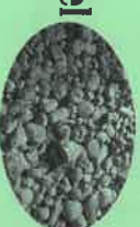
Screened Pit Run Gravel