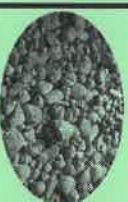
Pit Run Gravel