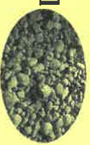
Screened Pit Run Gravel