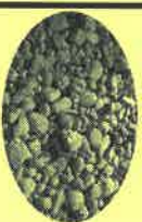
Pit Run Gravel