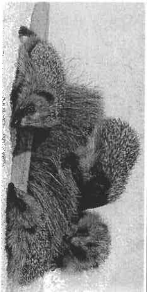
AHHHH - Feels just like mom used to feel.