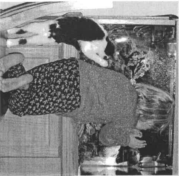
Are you sure you put the fish in?