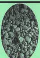
Pit Run Gravel