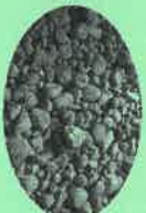
Screened Pit Run Gravel