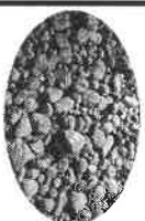
Pit Run Gravel