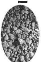
Screened Pit Run Gravel