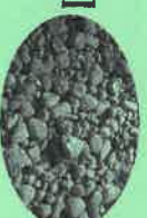
Screened Pit Run Gravel