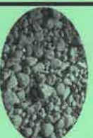
Pit Run Gravel