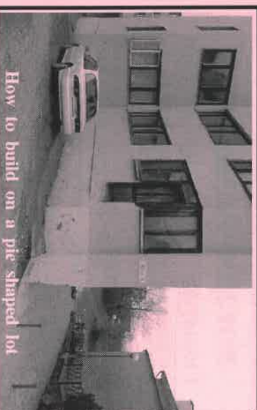
How to build on a pie shaped lot