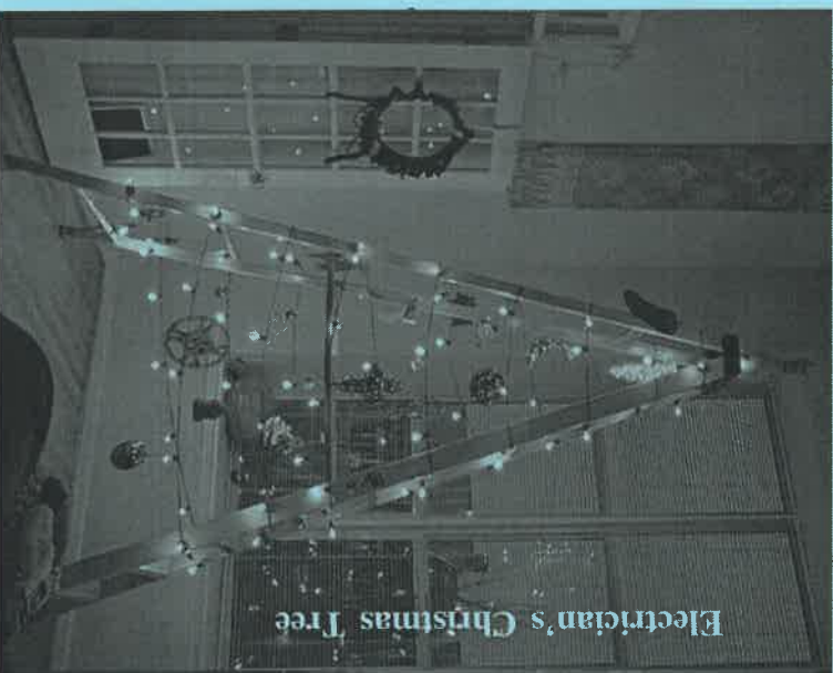
Electrician's Christmas Tree