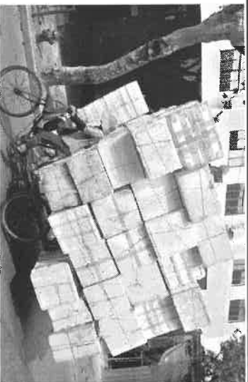
The first courier service.