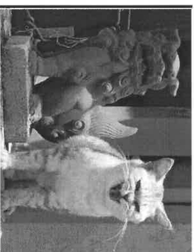
Once again art mimics reality.

Take a Break in McBride...B.C.'s Friendliest Town?!