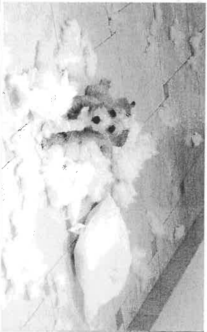
Take a Break in McBride...B.C.'s Friendliest Town!

Anglican United Church - Downtown Thrift Store on Dominion Street. - Mens, ladies and children's clothing -Open: Tues. 1:00 to 3:00 - Sat. 10:00 to 12:00 • Dorcas is OPEN Tuesdays 1pm-3pm. Phone 569-3186 •Contact number for the Foodbank is 569-3186 • Seventh-day Adventist Church -Meet Saturdays at 9:30 & 11am. and Wednesdays at 7pm. Phone: Ph:569-3370 • Mennonite Church -Meet Sundays 11am and 7:30pm & Wednesdays at 7:45pm Ph:569-0445 • Mountain Chapel (PAOC) -Sunday School & Adult Classes-10am, Services-11am. Ph:569-3350 • Anglican United Church - 441 Dominion Street. Meet Sundays at 9:00 a.m. Phone 569-3206 or 569-3386. Hall Rental contact Dorothy Simpson 569-3343 • Evangelical Free Church -Sunday School @ 9:45 a.m. *Sunday Worship Service at 11:00 a.m. Ph:569-2378 or 569-8845 Pastor Dan Carlaw • Robson Valley Christian Centre -Meets in home Sundays 11am, Dunster Ph:968-4335 • St. Patrick's Catholic Church -Meets Sundays at 11:00am Ph:569-2606. "Catholic Faith for Adults" inquiry class. Contact Sr. Olive.