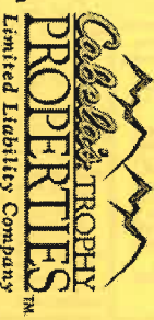
Province of British Columbia, Canada Limited Liability Company