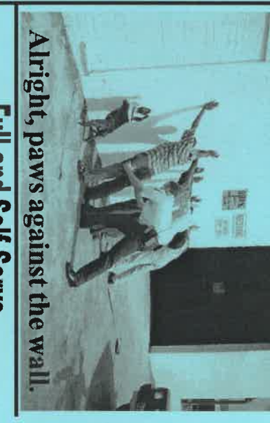
Alright, paws against the wall.

Monday to Saturday 8am-7pm Friday 8am-8pm Sunday Closed