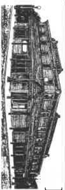
MCBRIDE HOTEL 569-2277

Two people can live as cheaply as one what?