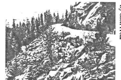
By Glen Frear

Did you know?? The Gallery features only Local Artists' work??